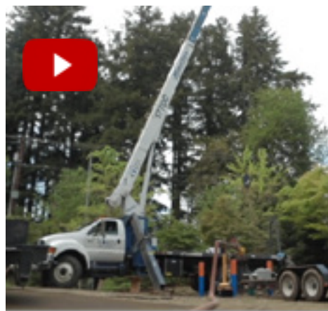
Where are we Today?