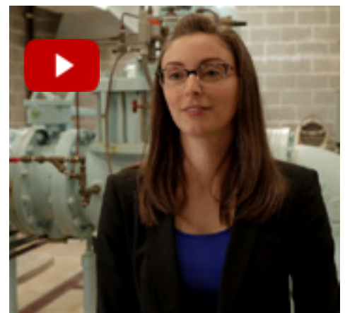
Looking to the Future